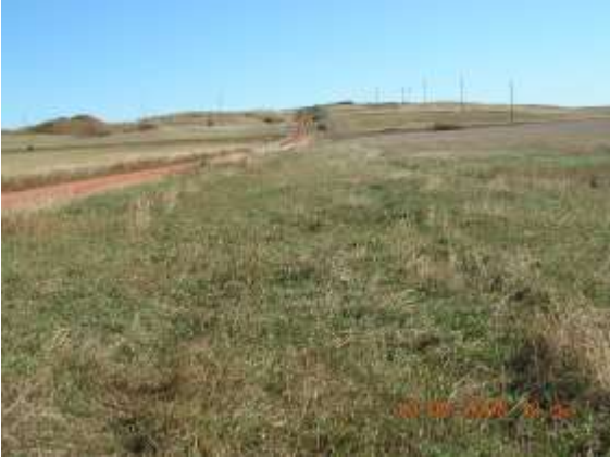
Road ditch on 8 Oct 2008