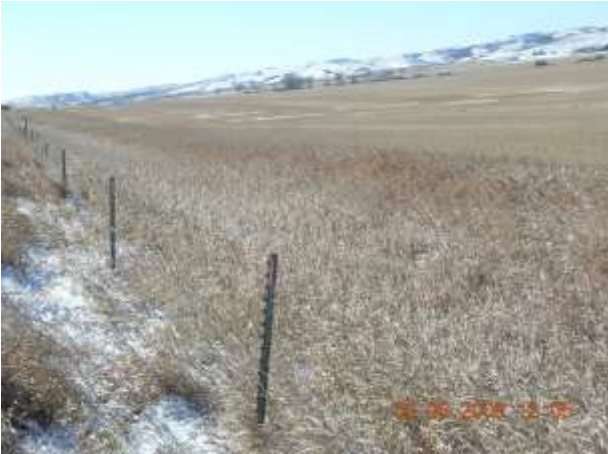
Diversion ditch on 8 Oct 2008