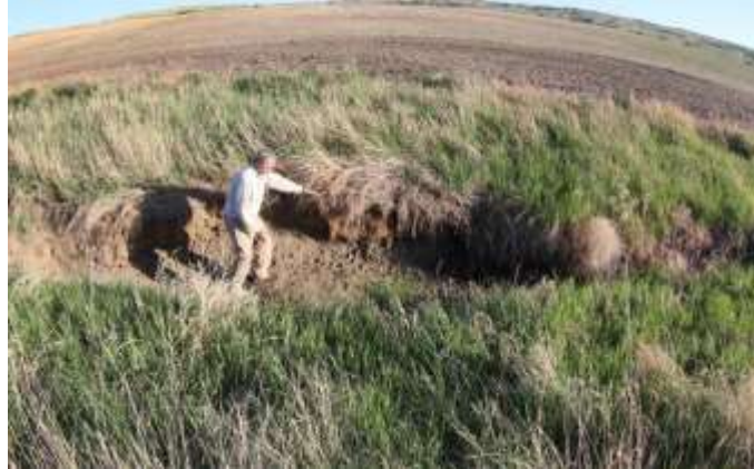
Road ditch on 3 Jun 2021